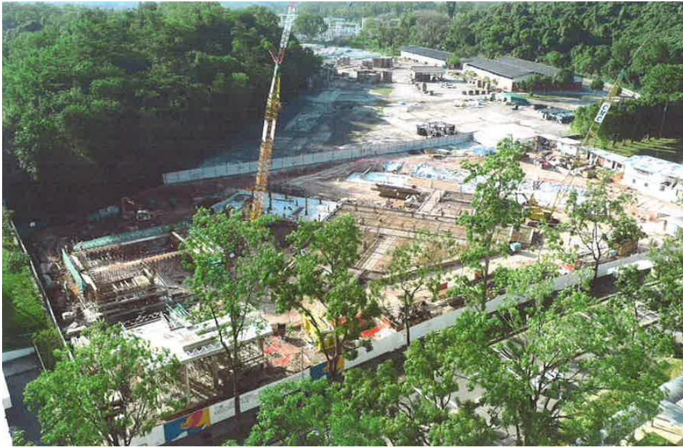
Overall site bird eye view (18%)