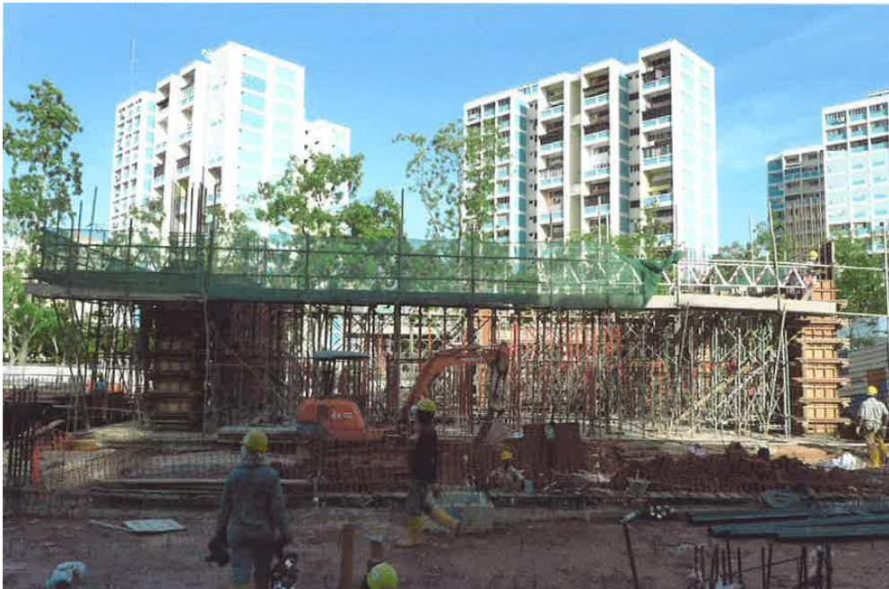
Hall block (17.5%)