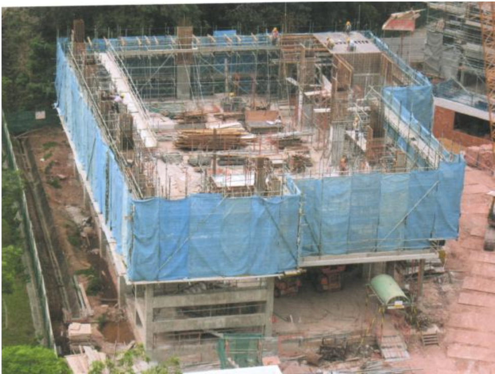
Hall block (30%)