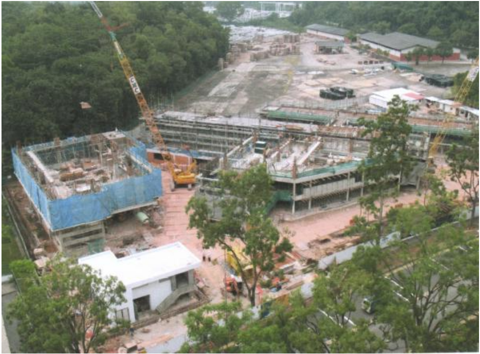
Overall site bird eye view (32%)